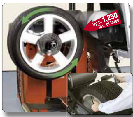
The Road Force balancer identifies tire and rim contributions to radial vibration problems.

The Auto34 makes match-mounting easy with bead rollers that allow the operator to spin the tire on the wheel regardless of aspect ratio or tire stiffness.