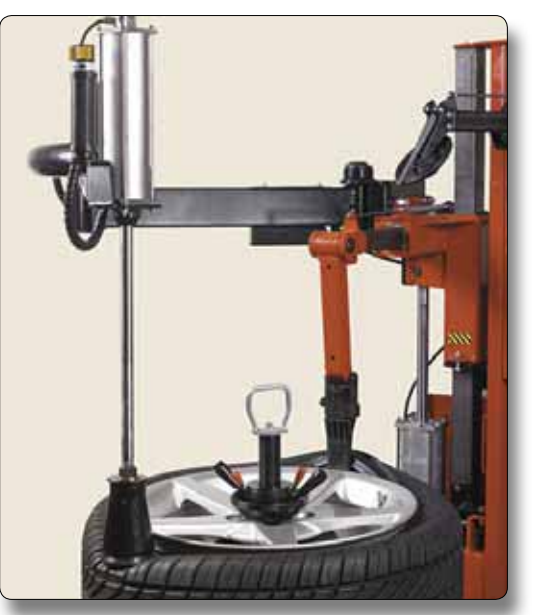
Bead press arm eases de-mounting of a standard tire. Used to press opposite side of tire into drop-center.