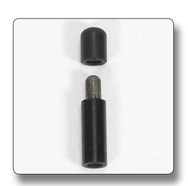
Anti-rotation pin extensions are used with reverse wheels.