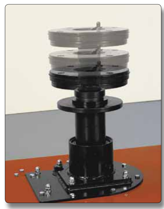
With three easily adjustable clamping heights, no flange plates are needed for most reverse wheels. All offsets and reverses are serviced at the same approximate height.