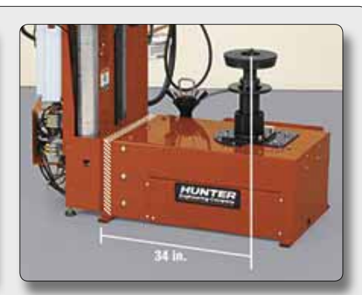
Extended position, handles 14- to 34-in. wheels.