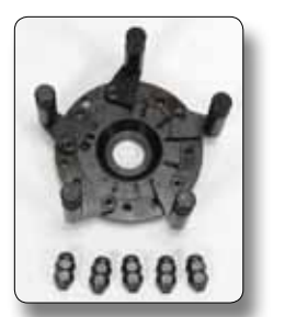
Flange Plate Kit (RP6-G1000A87)