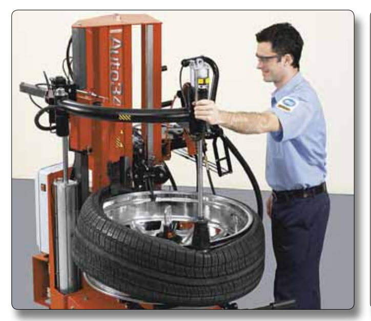
Bead press arm pushes tire in drop-center for easier mounting.

The bead press arm is secured to the tool head controls and is cleared out of the way automatically as the tool head is raised.