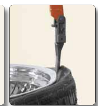
Patented tool head inserts itself into tire, pulls bead over and demounts in one fluid down/ up motion.