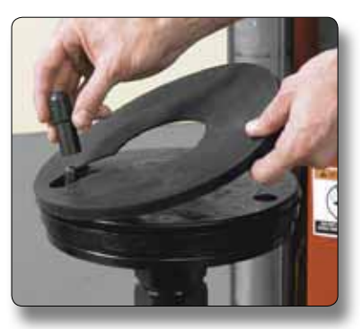
Rubber cover protects expensive reverse wheels from damage.