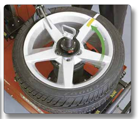
Match-mounting the stiffest point on a tire to the low spot on a rim makes the assembly roll as round as possible.