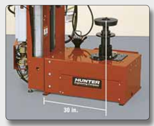
Standard position, handles 10- to 30-in. wheels.

Three-position expandable base adds versatility. Start with standard 30-in. configuration. When you service larger wheels, simply loosen 9 bolts to slide base out for 32-in. or 34-in. capability. No expensive kits or modifications necessary.